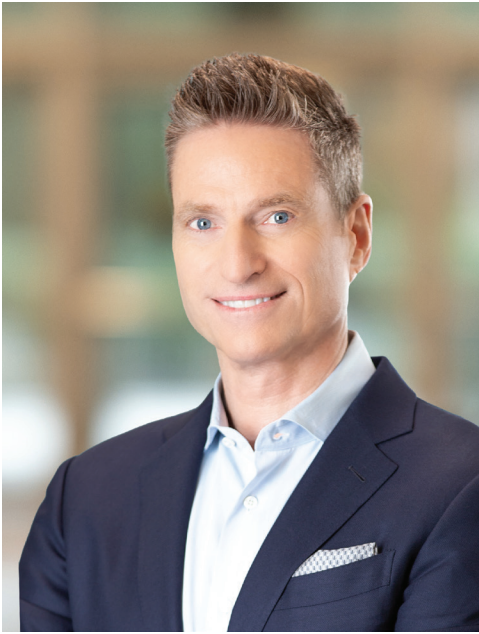
James D. Taiclet

Chairman, President and Chief Executive Officer