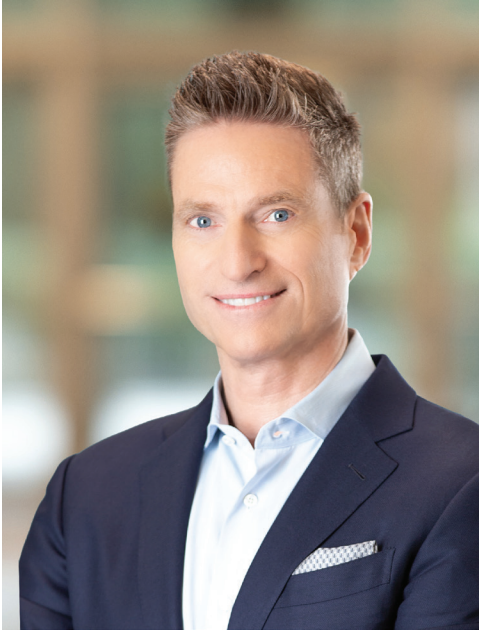
James D. Taiclet

Chairman, President and Chief Executive Officer